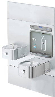
Shown with two optional access panels installed